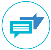
Send general program feedback