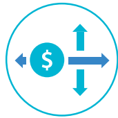
Reallocate budget among 2 or more vendors