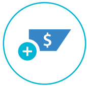
Increase overall budget