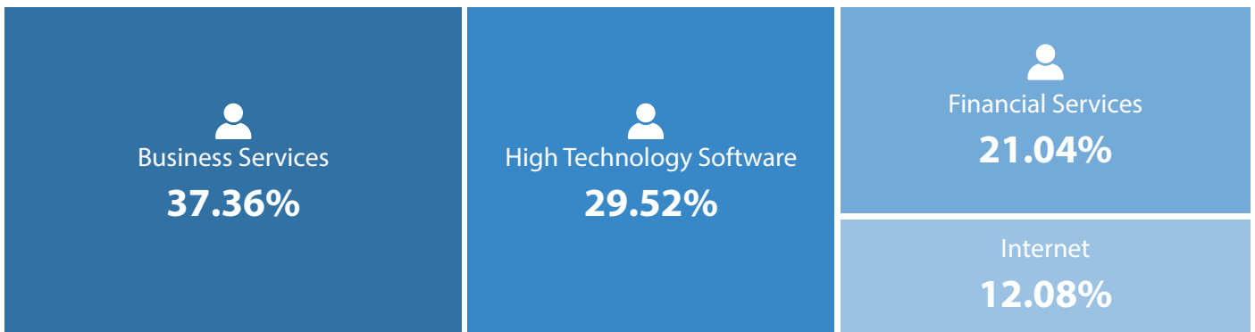
% of Leads by Industry

The top industries that the leads belonged to were: